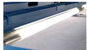
Lighting 4 or 6 tubes, fluorescent or LED