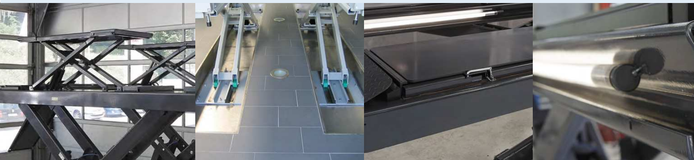
PLUS AMS VERSION (above ground installation): with wheel free lift + wheel alignment set + optional Axle Jack