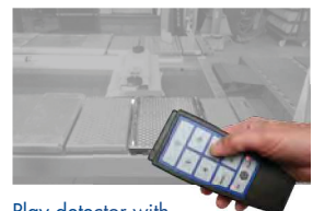
Play detector with remote control